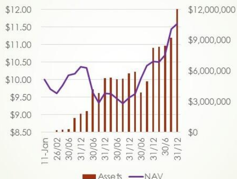
Veritas Foundation Giving Fund Assets & Net Asset Value Per Unit